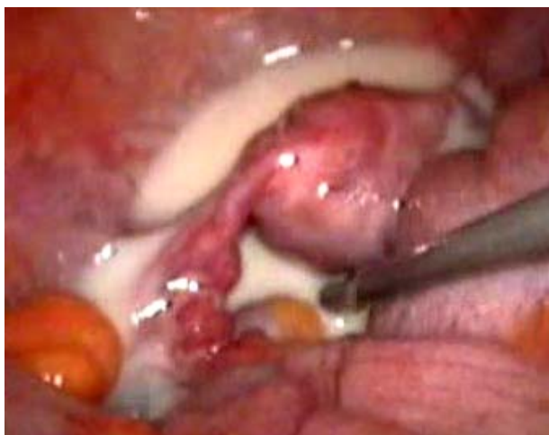
Figure 2. laparoscopic excision of retroperitoneal cyst lymphangioma.

malignant mesenchymoma, biliary cystadenoma/carcinoma and cystic mesothelioma [1]. Benign cystic lesions of the retroperitoneum include lymphangioma, microcystic pancreatic adenoma and cysts of urothelial and foregut origin. Cysts of foregut origin are subdivided into bronchogenic cysts, which contain cartilage or seromucinous respiratory glands, oesophageal cysts, which are composed of well-developed layers of smooth muscle without cartilage, and simple foregut cysts, which have none of these distinguishing features [1].